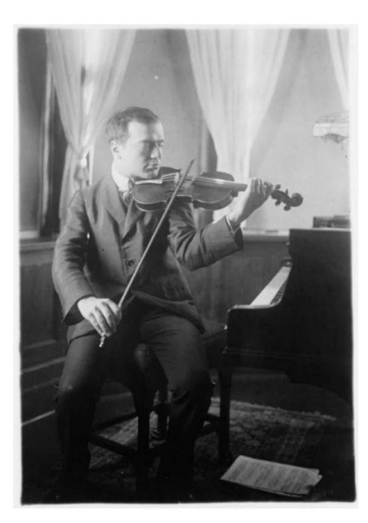
Bronislaw Huberman, ca. 1908

Filming for Another Dawn began the last week of September 1936, and reportedly wrapped up in mid-December. Additional scenes were filmed in mid-February 1937, and the final cut was completed sometime