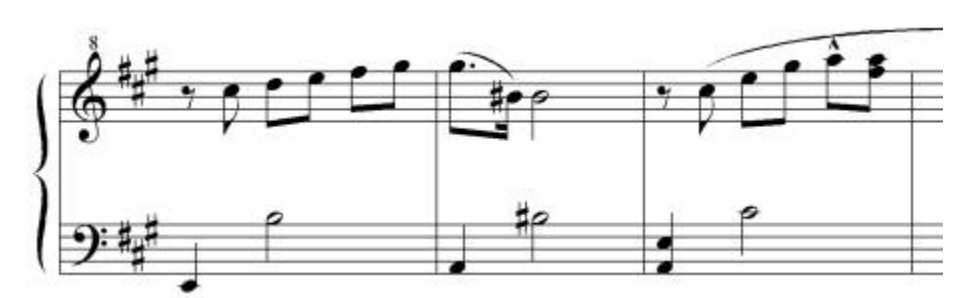
Figure 2. Meausres 8-10 of Korngold's "Beim Großmütterchen" highlighting chromaticism in the bass.

As with others of Korngold's early works, directions for the performer are somewhat lacking. In measure 14 we find the only indication of tempo and style in this whole composition: "lente/breit". The first term is Italian and means "slow(ly)"; the second term is German and means "broadly". So Korngold appears to indicate this section is to be played – we assume – more slowly, more "broadly" than the first. Which leaves the question about the intended style of the first section.