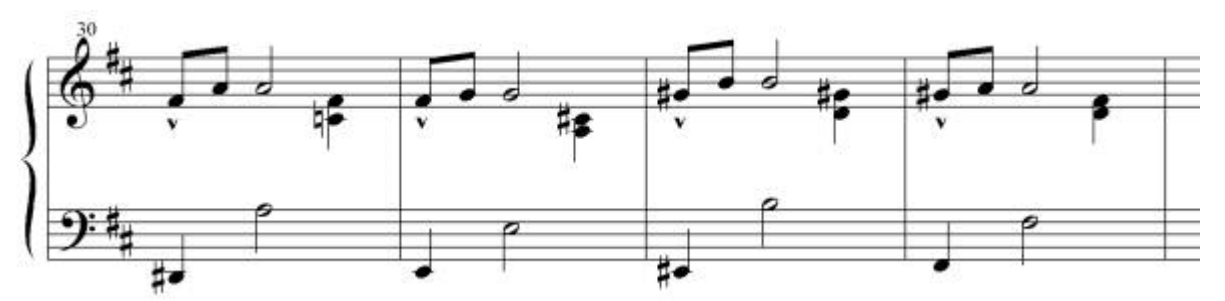
Figure 3. Transcription of mm. 30-33 of Korngold's "Beim Großmütterchen".

Korngold repeats this eight-bar idea, with some development, in measures 38-45 in which the melody is transposed one octave higher, and ends on a D instead of an A. The major development of these measures revolves around the left hand accompaniment. As seen in Figure 4 (compare with Figure 3), the same rising chromatics from the bass of measures 30-33 are repeated, but this time they are followed in each measure with a falling chromatic, four-note scale. Comparing the two sets of four measures (mm. 30-33 & 38-41), we see that the first and third scales (mm. 38 & 40) begin on the same note as the half notes in measures 30 & 32, and in the second and fourth measures (mm. 39 & 41) the chromatics end on the same note as the previous half notes – an ingenious juxtaposition of scale figures. In order to display these chromatic runs more effectively, Korngold shifts the right hand chord from beat three to the half-notes on beat two of each measure.