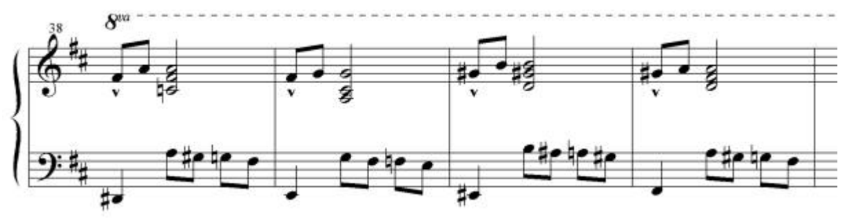
Figure 4. Transcription of mm. 38-41 of Korngold's "Beim Großmütterchen".

Korngold repeats this eight-bar idea, with some development, in measures 38-45 in which the melody is transposed one octave higher, and ends on a D instead of an A. The major development of these measures revolves around the left hand accompaniment. As seen in Figure 4 (compare with Figure 3), the same rising chromatics from the bass of measures 30-33 are repeated, but this time they are followed in each measure with a falling chromatic, four-note scale. Comparing the two sets of four measures (mm. 30-33 & 38-41), we see that the first and third scales (mm. 38 & 40) begin on the same note as the half notes in measures 30 & 32, and in the second and fourth measures (mm. 39 & 41) the chromatics end on the same note as the previous half notes – an ingenious juxtaposition of scale figures. In order to display these chromatic runs more effectively, Korngold shifts the right hand chord from beat three to the half-notes on beat two of each measure.