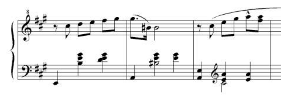
Figure 1. Transcription of mm. 8-10 of Korngold's "Beim Großmütterchen".

Two things strike the listener, however, that suggest the Mozart-like comparison above as inappropriate or invalid. The first is the "apparent" stray B# in measure nine (see Figure 1), a dissonance usually foreign to a composer like Mozart, and second, the rather late establishment of the piece's tonic key of A-major. Taking the latter first, examination shows that measures 1-9 all employ some form of an E-chord (most often an E7) that continually hints at tonic A-major. The tonic A-major chord, however, is not actually heard until measure ten, only three bars from the end of the main theme/passage. Such a delayed establishment of the key would serve Korngold exceptionally well in later works, most notably the opening bars of Violanta, op. 8.