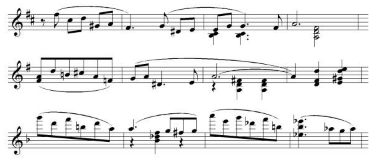
Figure 7. Passage from "Beim Großmütterchen" (top) and two passages from "Der Schneeman" (mid & bot).

In "Beim Großmütterchen", however, one motivic element can be found – albeit, in developed/modified form – in the work which immediately follows it. At the top of Figure 7 is a passage from "Beim Großmütterchen". The middle and bottom staves in Figure 7 are two separate passages from the piano score of "Der Schneemann." Note the similarities between all three passages: the falling steppattern in eighth-notes; the appearance of a dotted-quarter immediately thereafter; some form of rising or near-rising pattern following the dotted-quarter; and so forth – as if Korngold had stumbled upon a good idea in one work, and sought to improve upon it in his next.